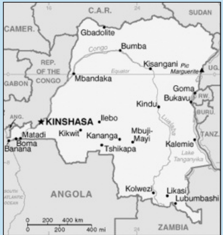
Democratic Republic of Congo in 2006

And in 2002 Belgium finally admitted its complicity in the assassination of the first Congolese leader Patrice Lumumba within months of his assuming office.