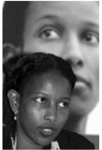
Ayaan Hirsi Ali.

Caroline Fourest is a secular intellectual and activist in France.