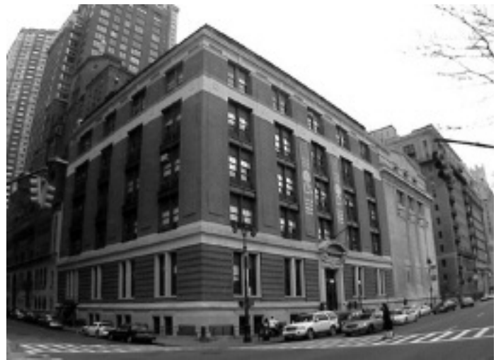
Ethical Society School

It was in 1878 that Felix Adler, the founder and pioneering leader of the Ethical Culture Society, established a "free kindergarten." Motivated by the needs of poor working families and by the emerging progressive tradition in education, this first step became within two years what was called "The Workingman's School." Over the next decades it grew grade by grade. It was among the first to provide science laboratories, art