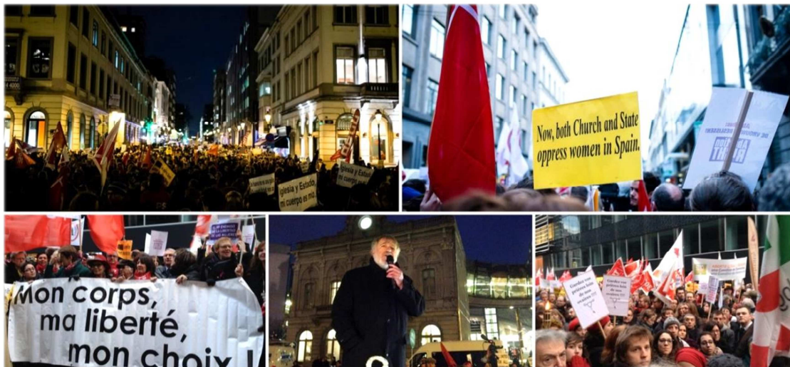
Demonstration in Brussels to support abortion right in Spain - 29 January 2014

On 20 December 2013, the Spanish Council of Ministers approved a draft bill which aimed at altering the current law on SRHR by dramatically restricting a woman's right to have an abortion. If approved, abortion would be permitted in Spain only in the case of rape or should the pregnancy pose a serious physical or mental health risk to the mother.