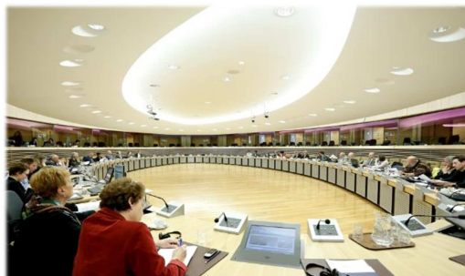
Dialogue seminar at the Commission

The EHF co-organized a dialogue seminar with EU Commission’s representatives, MEPs and researchers on the rise of extremism and populism in Europe. The EHF challenged the Commission on its strategy to fight these developments and to secure democracy and the rule of law in Europe. This event was organized in the framework of Article 17 TFEU under which EU institutions must maintain an “open, regular and transparent” dialogue with churches and non-confessional organisations. The EHF had to fight for several years in order to be able to organise these sorts of meetings with the European Commission, whereas churches had been granted them automatically for years.