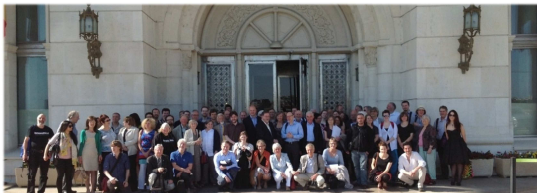
EHF General Assembly, Palace of the Parliament, Bucharest – May 2013

In 2013, the EHF held its General Assembly in Bucharest (24 May) alongside two other important humanist meetings: the International Humanist and Ethical Union (IHEU) General Assembly (26 May) and a joint conference on “Education, Science and Human Rights” co-organised with the Romanian Humanist Association and IHEU (25 May).