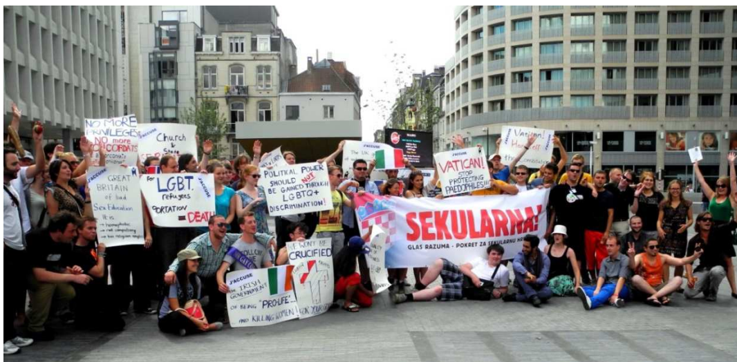
Freeze protest, European Humanist Youth Days in Brussels – August 2013

In 2013, we also helped (and sponsored) the International Humanist and Ethical Youth Organization (European office) organising the “European Humanist Youth Days” to strengthen the links between young humanists in Europe. We supported a meeting in Brussels (from 2 to 5 August 2013) that brought together over 120 young people from across Europe for conferences, artistic and cultural workshops. Participants discussed the future of Europe and the need to uphold and "return" to enlightenment values; as well as taking part in a diverse array of workshops on artificial intelligence, graffiti and democracy.